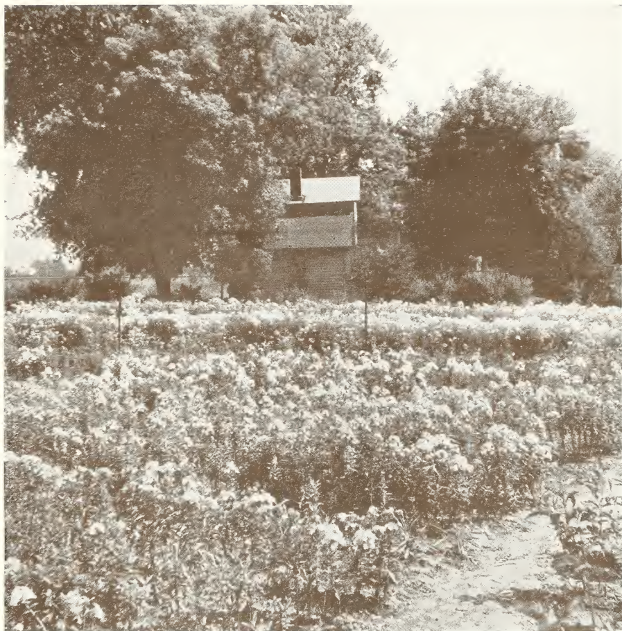
View of two year field grown Phlox